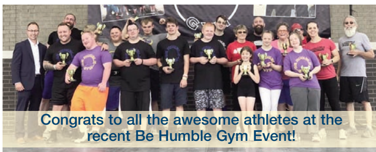
Congrats to all the awesome athletes at the recent Be Humble Gym Event!