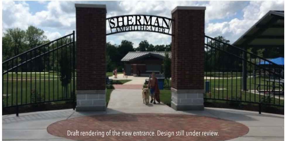
Draft rendering of the new entrance. Design still under review.

The designs for the new entrance to the Amphitheater are still under review by the Board of Trustees. The entrance structure will be installed at the same time as the fencing.