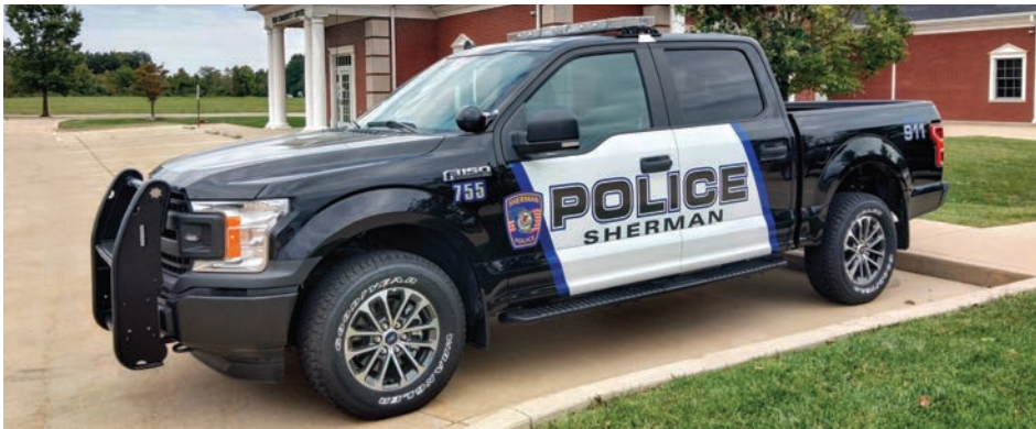
Sherman Police Department recently put its newest police vehicle – a 2020 Ford F150 squad – into service.