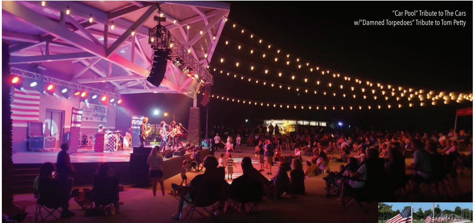
"Car Pool" Tribute to The Cars w/"Damned Torpedoes" Tribute to Tom Petty