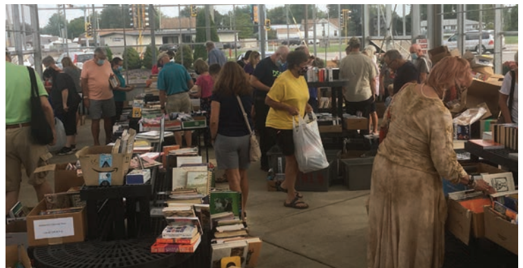
The Friends of Sherman Library held a well-attended book sale at Seaney's Greenhouse on October 1 and 2.