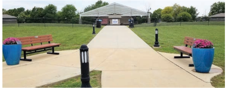
The Villas donated two benches and two blue planters that flank the entrance to the Village Park Amphitheater. The Sherman Community Foundation planted them with mums for the season.

The Foundation is seeking new members. Anyone interested in meeting new people, having some fun, and being part of the positive impact on Sherman should visit www.shermanil.org and click on the Foundation tab.