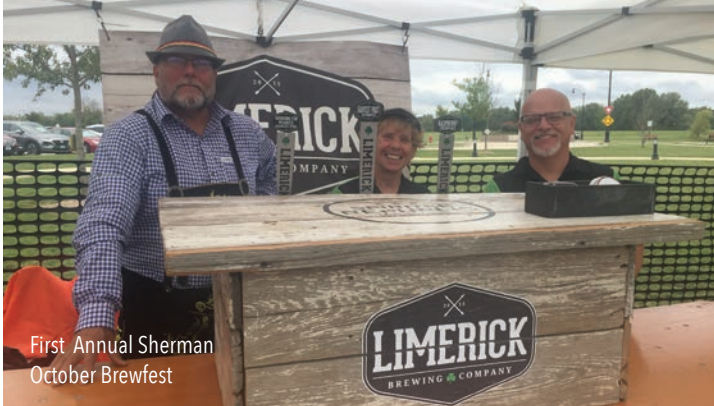
First Annual Sherman October Brewfest