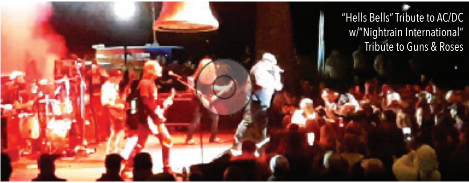
"Hells Bells" Tribute to AC/DC w/"Nightrain International" Tribute to Guns & Roses