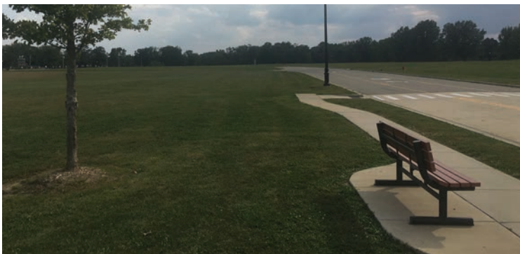
The Village has purchased the remaining land south of Village Park, all the way to the tree line adjacent to Cabin Smoke Drive. The Board is in the early stages of exploring the future use of the space. We will keep you posted.