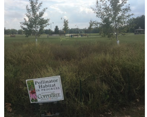
The new Pollinator Habitat planted under the new trees came to life this summer with birds, bees and butterflies, creating an innovative teaching hardscape at the playground.